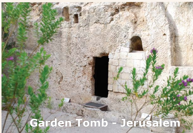
Garden Tomb - Jerusalem

Today our memorable journey and Holy Land pilgrimage comes to an end. We will transfer to the airport in Tel Aviv and board the plane for our return flight home. In flight we can fellowship with our friends and remember the many things we shared together.