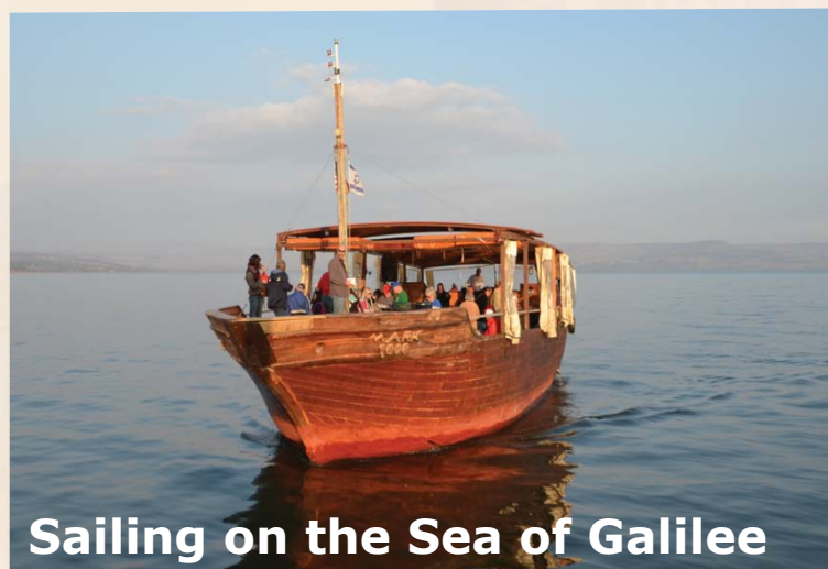
Sailing on the Sea of Galilee

After breakfast at our hotel we will meet our local guide and driver and begin our tour of the Holy Land. We start with a visit to Joppa, Jonah's port of embarkation for Tarshish. Joppa was also the home of Tabitha (or Dorcas) who was raised from the dead by Peter. It was also here that Peter learned that God was interested in the salvation of the Gentiles. After our tour of Joppa, we will travel up the coast to Caesarea by the Sea. There we will visit the Crusaders' castle, the Roman theater, the seaport from which the Apostle Paul sailed to Rome, and the Roman aqueduct system. We will continue along the coast to Mount Carmel to see the site of Elijah's triumph over the prophets of Baal. After lunch we continue north to Megiddo on the Plain of Armageddon to see King Solomon's stables and water supply system. Prophecy will come alive at Megiddo as we look over the Valley of Armageddon, site of the final world war! We then travel to Nazareth, the boyhood home of Jesus, to visit the oldest of the churches of the annunciation. On our way to Tiberias we will stop in the little town of Cana where Christ turned the water into wine. We will hold a short ceremony in an ancient church for the couples who wish to renew their marriage vows. Then we'll proceed to our hotel in Tiberias on the Sea of Galilee for dinner and overnight. (B/L/D)