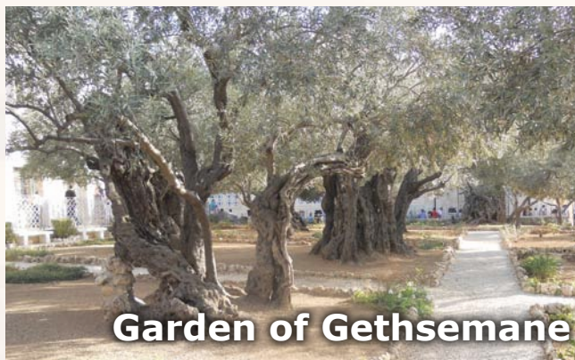
Garden of Gethsemane

Our second day in Jerusalem begins with a visit to the famous Western Wall and Tunnel excavation site. We will visit the Antonia Fortress, site of Pilate's Palace. We'll pass many of the traditional 14 Stations of the Cross on the Via Dolorosa and also see parts of the old colorful oriental market. We will continue our walk and visit the restored Jewish Quarter and