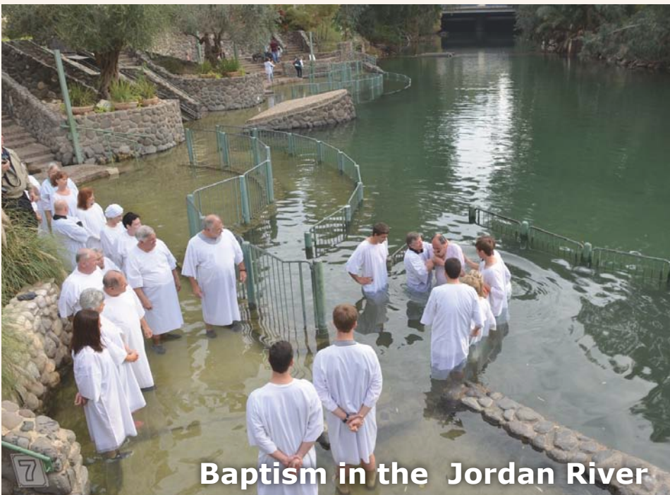
Baptism in the Jordan River

After breakfast we take a boat ride across the Sea of Galilee. While on the boat we'll pause for a brief